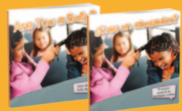
6 Spanish and 6 paired English books