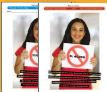
English and Spanish Blackline Master Activities