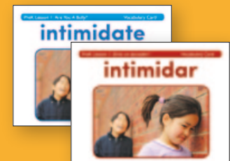
Vocabulary cards in both English and Spanish