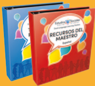
English Binder and Spanish Binder