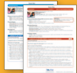
English and Spanish Teacher Notes with Parent Connection Activities