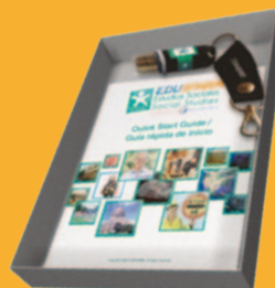
USB technology games with manual