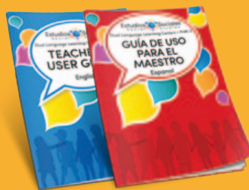
Teacher's User Guide in English and Spanish