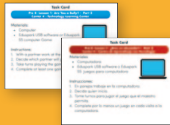
Task cards in English and Spanish